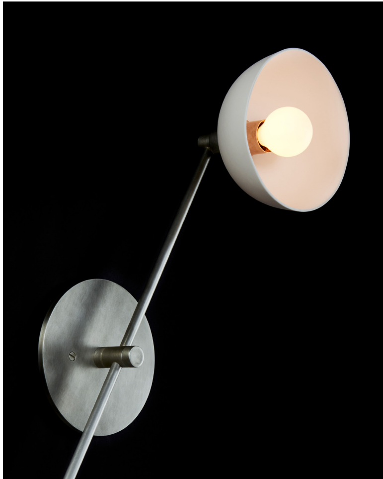
TARNISHED SILVER / PORCELAIN