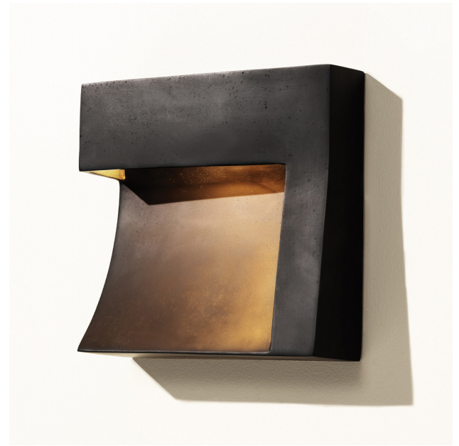
Handmade in Los Angeles

Finishes ● Matte black ● Bronze ● Satin aluminum