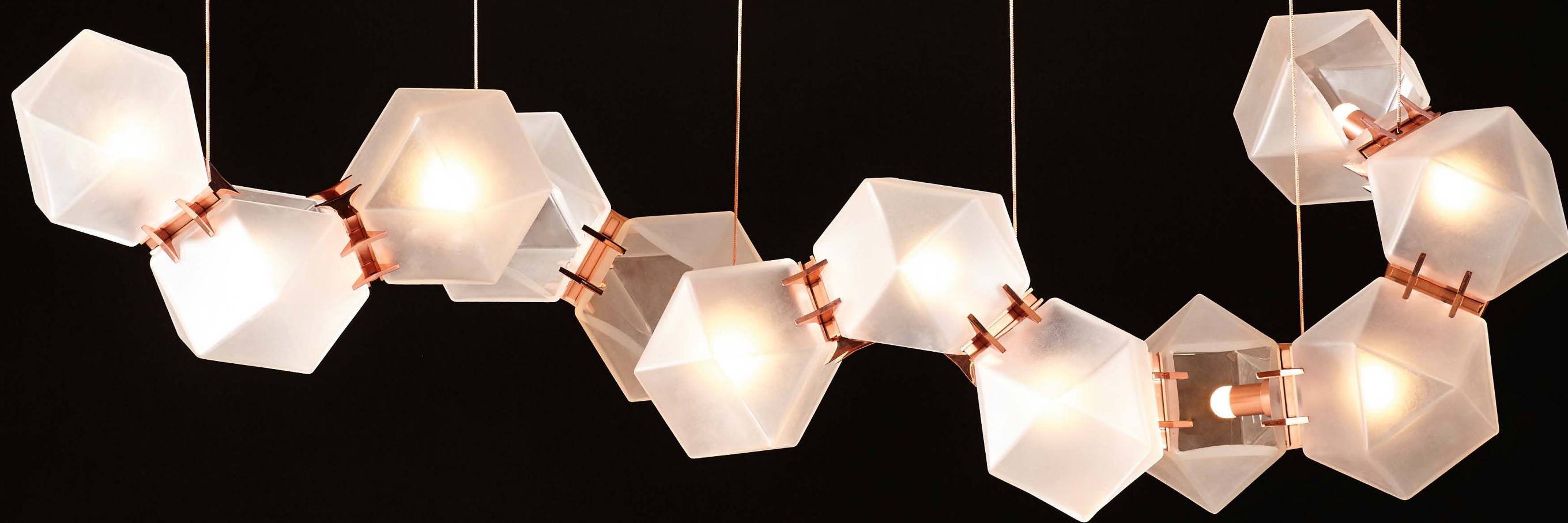
Gabriel Scott's Welles Glass in alabaster white blown glass and polished copper frame.